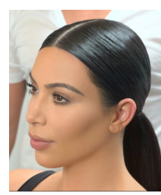
↑ slick low pony from centre