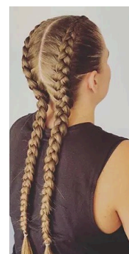
↑ 2 dutch braids