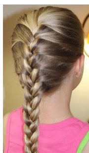
↑ 1 french braid